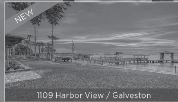
1109 Harbor View / Galveston