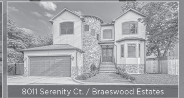
8011 Serenity Ct. / Braeswood Estates